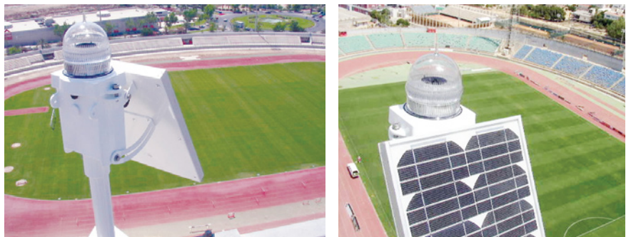
Sports Stadium Installations, Cyprus

This equipment meets the requirements of a Low Intensity Type A Obstruction Light, ICAO Annex 14 volume 1, "Aerodrome Design and Operations", Forth Edition July 2004.